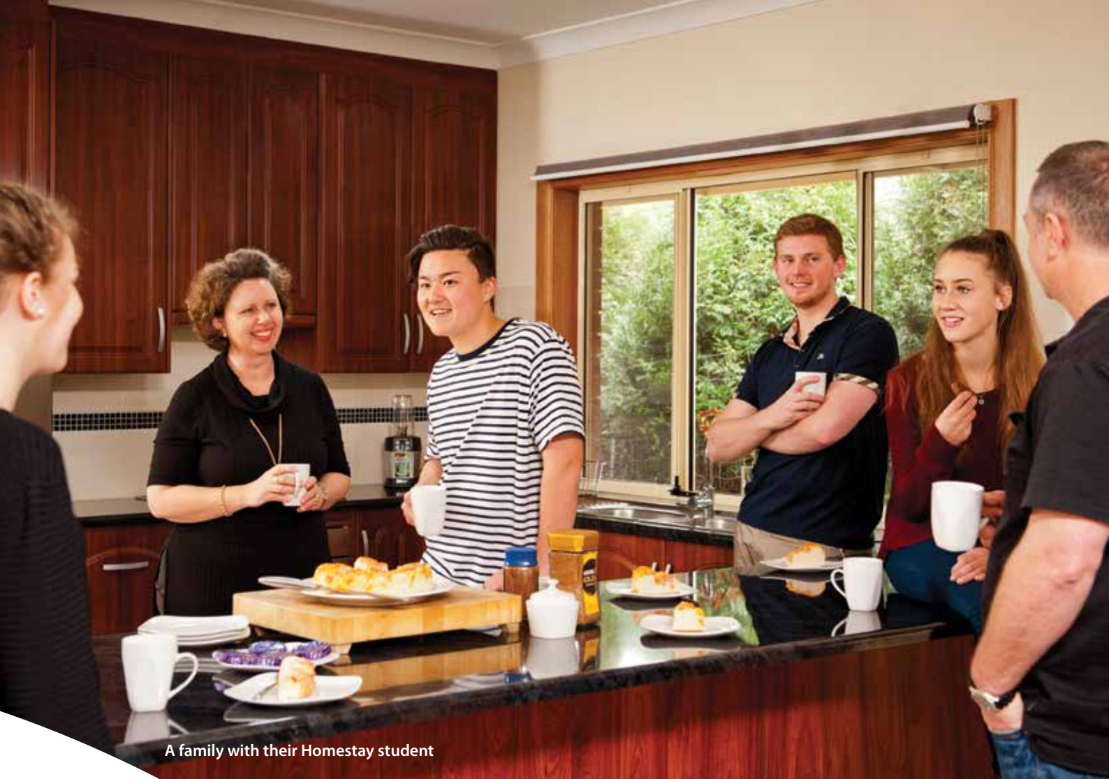
A family with their Homestay student