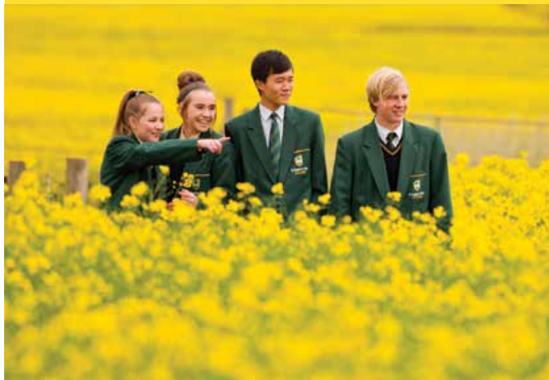
Senior students socialising in their study break

International students enrich our College in many ways. Their global outlook produces students who are citizens of the world.