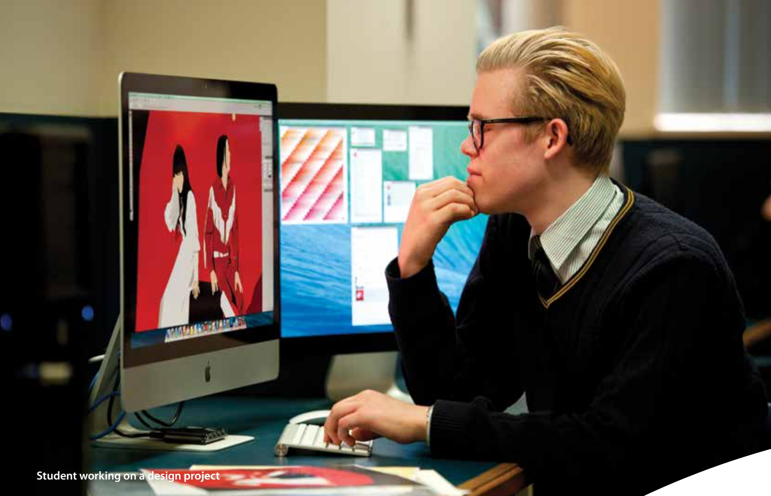
Student working on a design project