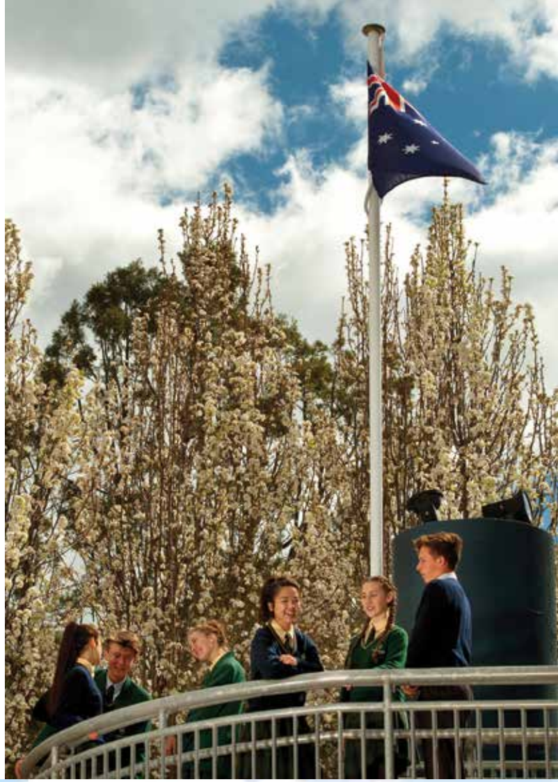
View of the College from the science facility